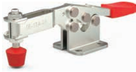
215-U Flanged Base U-Bar