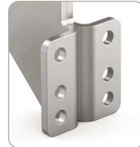
Space saving, compact front mount base.