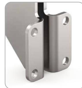
Space saving, compact front mount base.