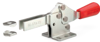
Flanged Base Model 217-U-L ⓘ