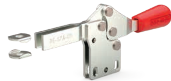
Straight Base Model 217-UB-L ⓘ

See page MC-ACC-7 for Complete offering of Open bar accessories